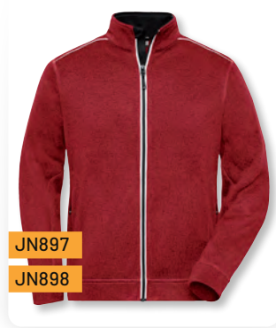
LADIES' • MEN'S KNITTED WORKWEAR FLEECE JACKET - SOLID -