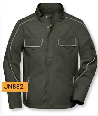
WORKWEAR SOFTSHELL LIGHT JACKET - SOLID -